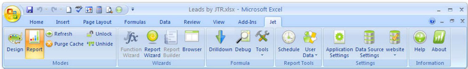
Jet Reports 2009 Excel Ribbon